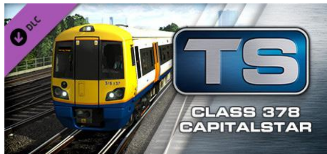
DTG Class 378 Capitalstar

For this soundpack to work you will require the base game Train Simulator 2019 and the following DLC