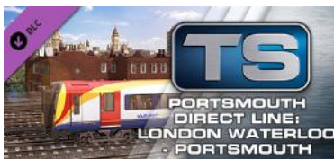
DTG Portsmouth Direct Line