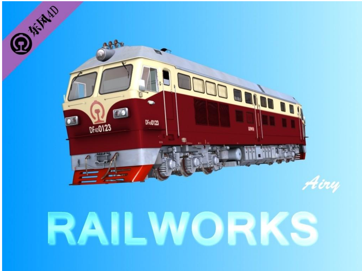
The highly detailed DF4D locomotive