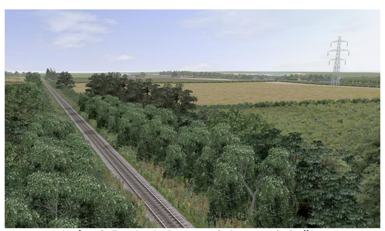
A view from the Trans Pennine Route created using textures by Geoff Potter