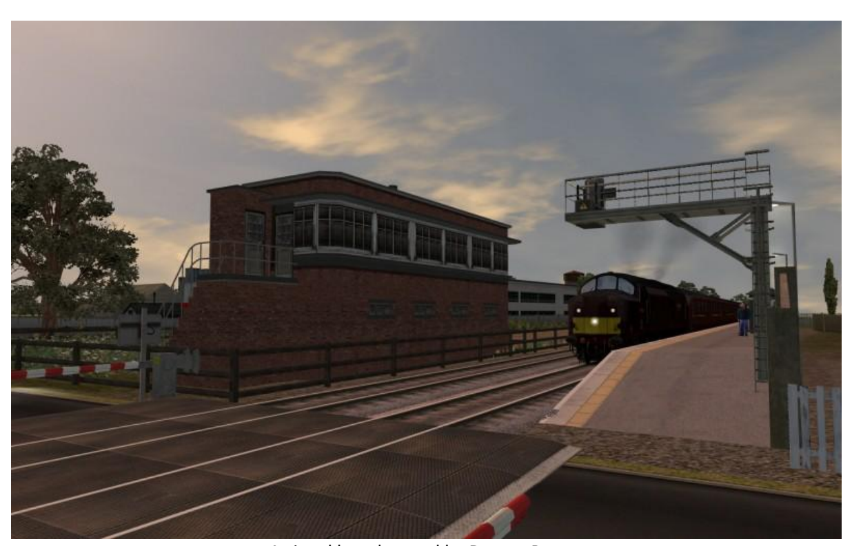
A signal box donated by Darren Porter