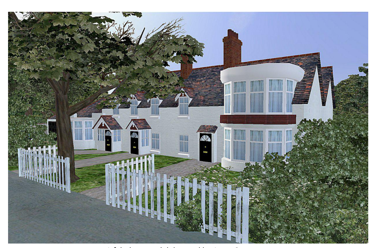
A fabulous model donated by AcornComputer