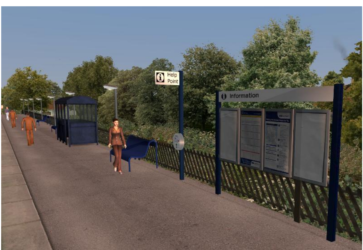
A few items of clutter used to add extra detail to a route.